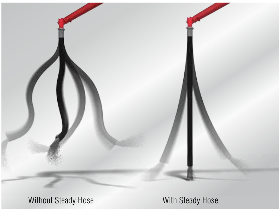
Without Steady Hose